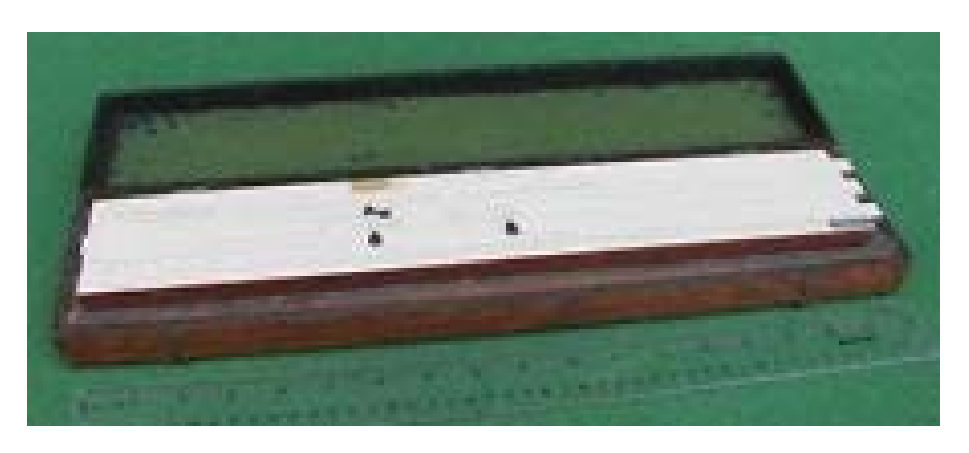
Keuffel & Esser Reymond 1924 Patent Leather Calculator - $976