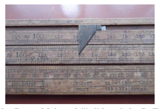
Aston & Mander Paper Makers 26" slide rule by L. Evans, best offer under $281

Fowler's Long Scale Circular Slide Rule in metal case - $234