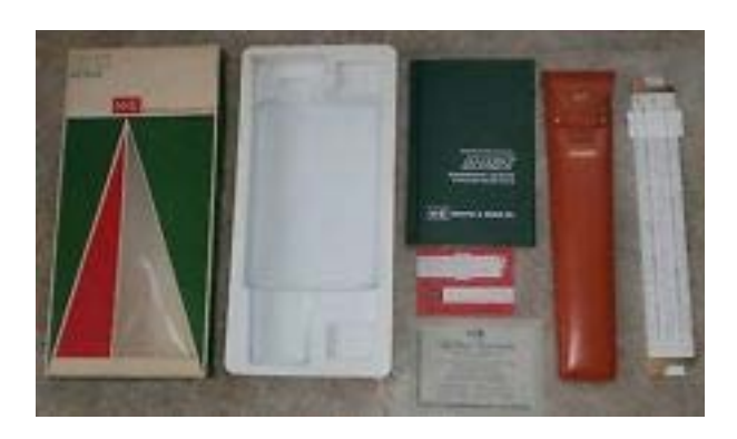
K&E Analon Slide Rule 68 1400 very rare, original box, instruction book - $534

Pickett N4P-ES Vector Type Log Log Dual Base Slide Rule 1959 with case - $249