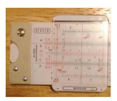
Berger Trigolog M 2150 Precision Slide Rule German - $123

Gravet-Lenoir Regle a calcul 25cm Successeur Tavernier-Gravet, c1870 -$136 Aristo Nuclear Slide Rule 10174, MIB - $125