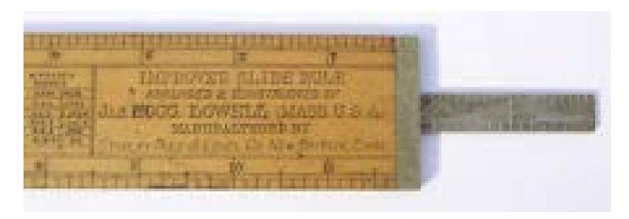
c1885 "Hoggs Patent Slide Rule" by Stanley Rule & Level Co. - $2,225

Faber Castell 2/84N Mathema Slide Rule MIB w/English Manual - $1,749