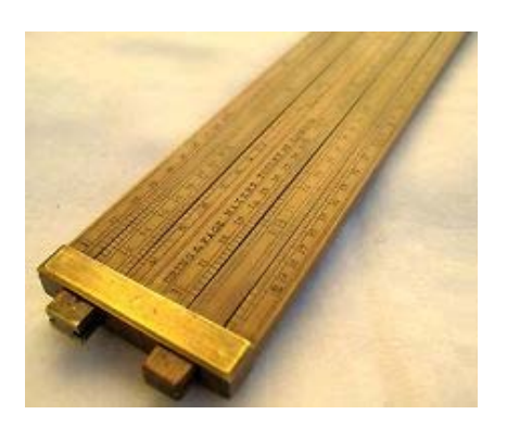
Dring & Fage gaugers customs & excise slide rule - $163

Ewart's Cattle Gauge Slide Rule - $171 Faber Castell 2/83N Slide Rule. MIB Clear / Green Clamshell Case - $168