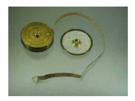
Chesterman's Cattle Gauge - $152

Gravet-Lenoir Regle a calcul 25cm Successeur Tavernier-Gravet, c1870 -$136 Aristo Nuclear Slide Rule 10174, MIB - $125