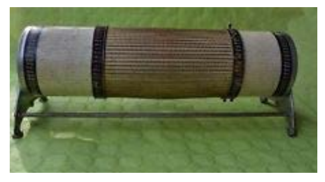
LOGA Rechenwalze Cylindrical slide rule 15m, fair condition - $202

Fowler's Long Scale circular slide rule calculator metal case & velvet pouch - $218