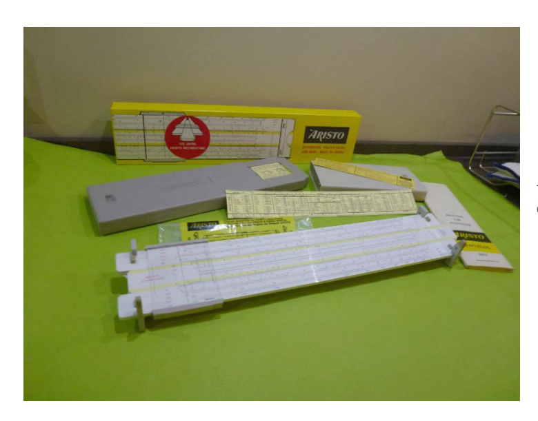
ARISTO 0972 HyperLog Slide Rule, MIB: $356

Faber Castell 2/84N Mathema slide rule, MIB: $1,749 Faber Castell 2/84 Mathema Hyperbolic slide rule: $910 Fuller Calculator, Type 1, date 1927, s/n 5755: $467