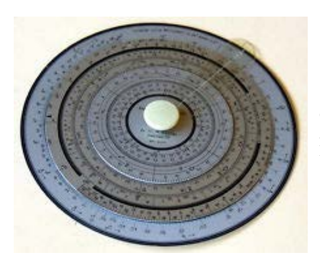
GEILER - ASTRO German Astronomic Circular Side Rule: $261