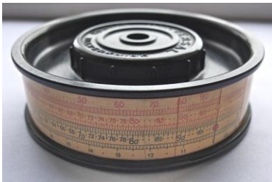
Swedish "Universal" cylindrical (hockey puck) slide rule. Sold for $350 This is a circular slide rule with the calculating scales [A B] [C D] on its rim surface. Not known to your editor before the eBay posting.