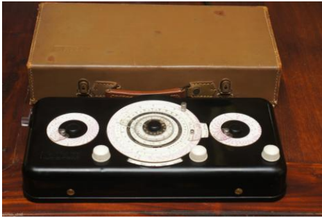
Arici T3 Regolo calcolatore per strutture di cemento armato for $1,086. Sold for $1,086. This is an Italian circular slide rule of substantial construction. It was made for designing reinforced concrete structures.